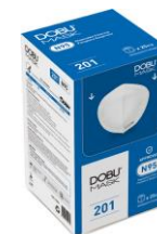
Box 25 pcs / box