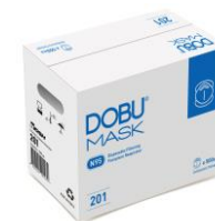
Carton 500 pcs / Carton